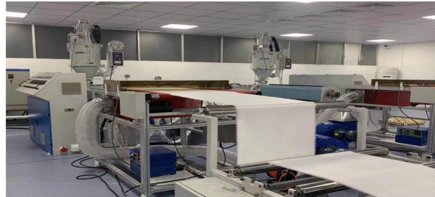
500 mm wide Fabric making Horizontal plant latest Costing Just 130000 USD FOB

Plant 1.6 Meter wide Fabric Making costing 800000 USD FOB