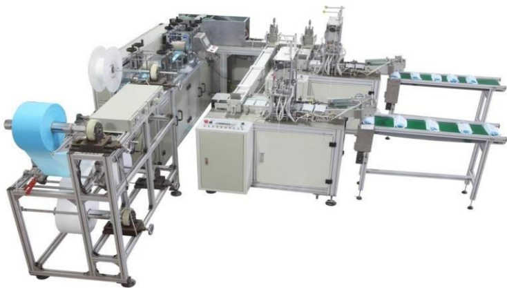
Normal Three-layer Flat Mask Making M/C

Melt Blown Is Mainly Filtration material needed to make Air/ water/ chemical/ industrial filters and also Normal Flat and N95 Masks. Raw Material costs Rs 95 per Kg & finished fabric at 1600 to 2400 Rs per Kg. Huge demand & highest possible margin business.